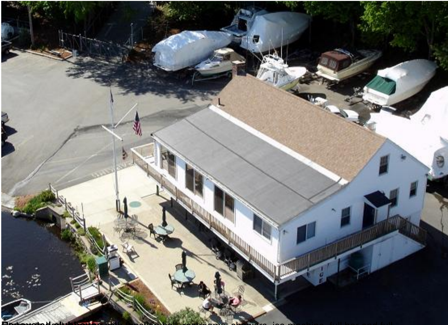
Renovated clubhouse with function hall, restrooms, showers, ice machine, full bar and full