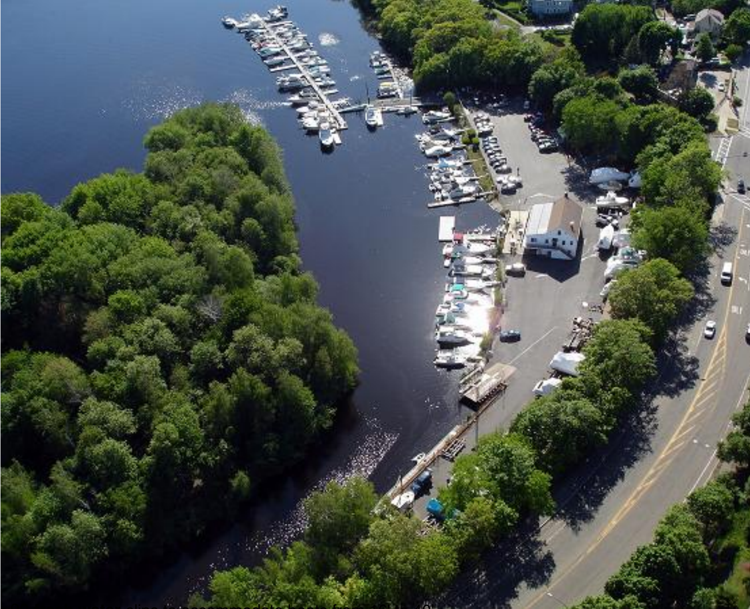
~90 fresh water slips to accommodate boats from 16' to 40'